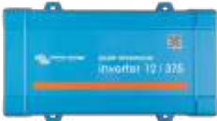
Inverter 12/375 VE.Direct